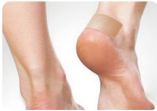
Protect the heel

Used to affix and fix dressings to wound surfaces or to fix other medical devices to specific parts of the human body.