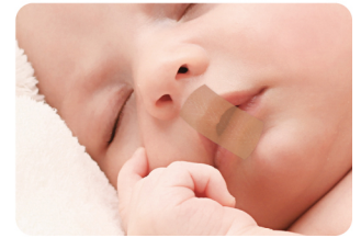
Correct sleep opening